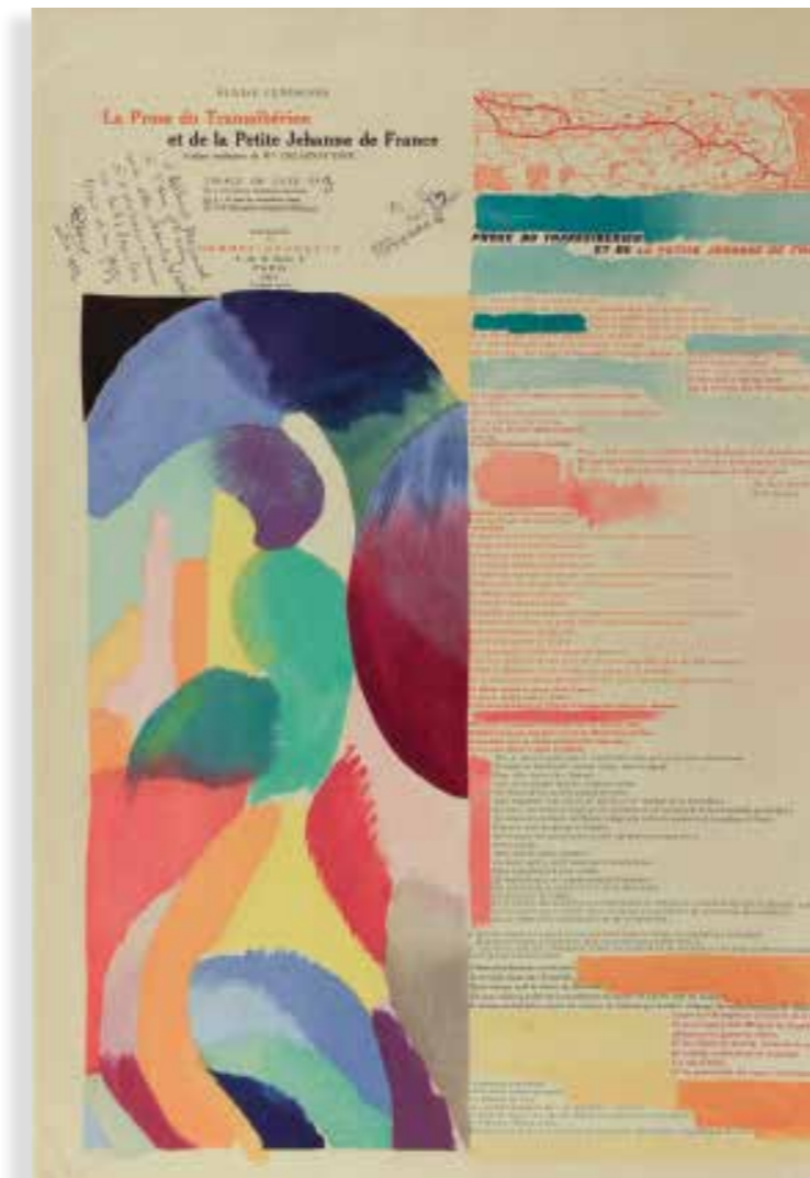
Prose du Transsibérien et de la Petite Jehanne de France. 1913. Sonia Delaunay (illustrated by), Blaise Cendrars (poem by) Editions des Hommes Nouveaux; Paris, France.