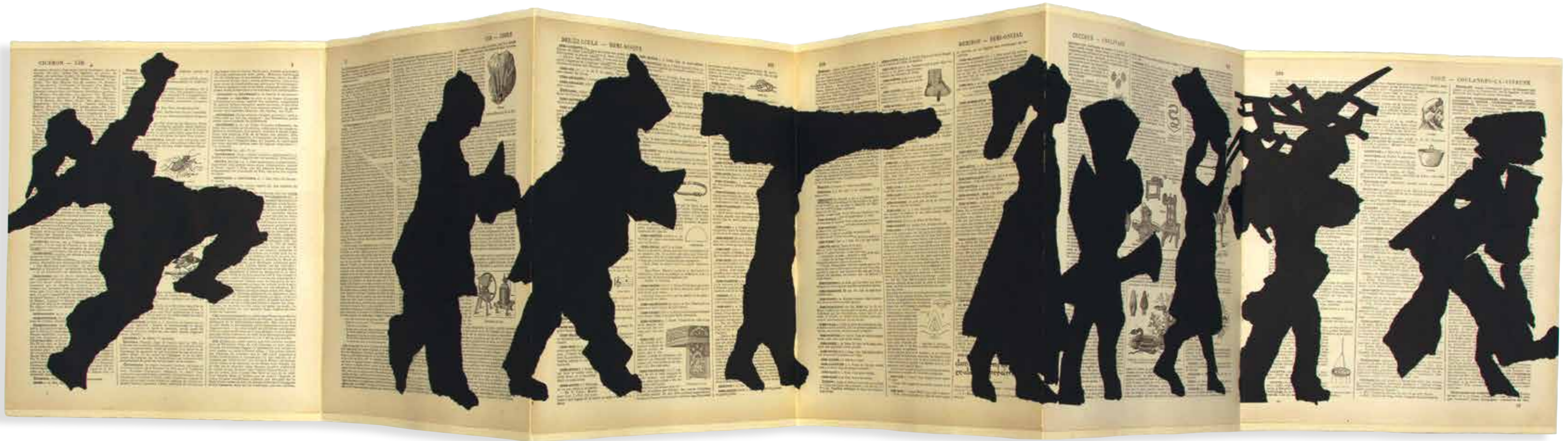
William Kentridge. Portage. 2006. The Artists' Press; Johannesburg.

place at the UJ Art Gallery at the University of Johannesburg Kingsway Campus from Saturday 25 March until 5 May 2017.